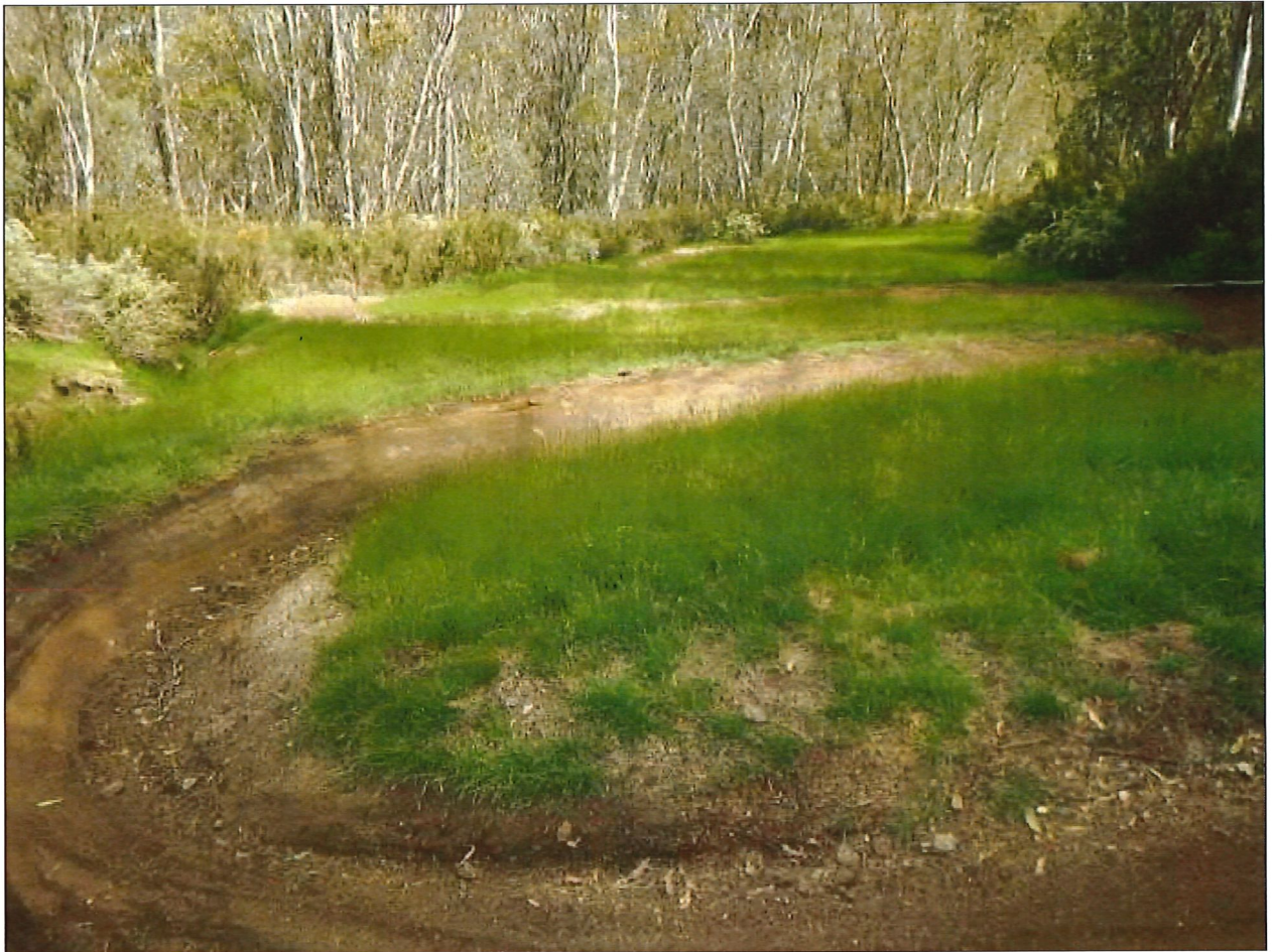
Figure 4: Existing trail along Dream Run illustrating large berms that impeded summer and winter access

attending an injury on the trails, weed management operations and trail works) and for snow mobile / groomer access during the initial and later parts of winter.