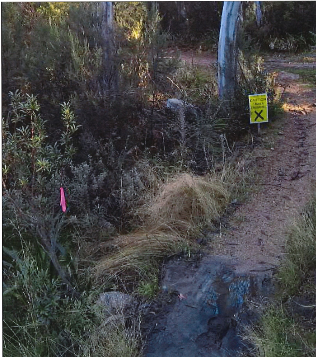
Figure 5: Photograph illustrating existing trail and proposed diversion (pink tag) to avoid Merritts Nature Track

With the modification to the alignment, an additional impact on existing vegetation is now proposed with approximately 25m 2 of native vegetation (Sub-Alpine Woodland) to be removed ( Figure 5 ). The Applicant also indicates that the alignment endeavours to avoid removing tree removal where possible.