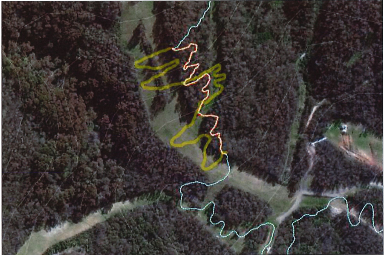
Figure 2: Proposed realignment of All Mountain Trail adjoining the High Noon / Dream Run ski runs – yellow line is existing